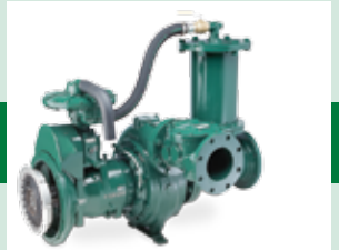
Typical Pump Configuration