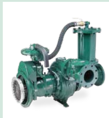
Typical Pump Configuration